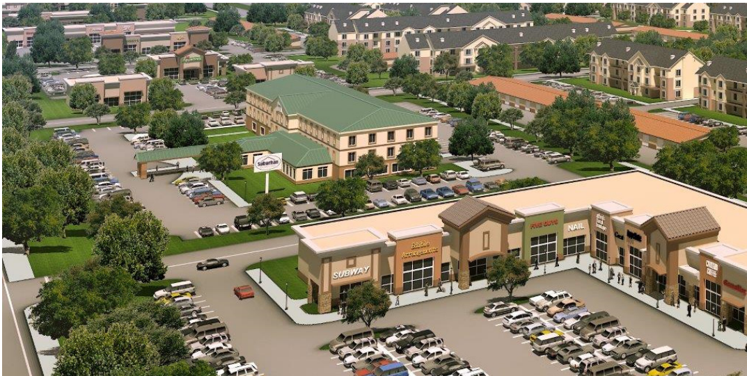
Northeast looking Southwest