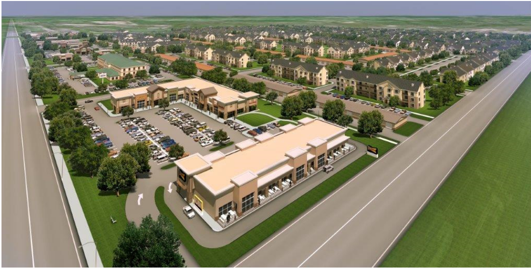
Northeast looking Southwest