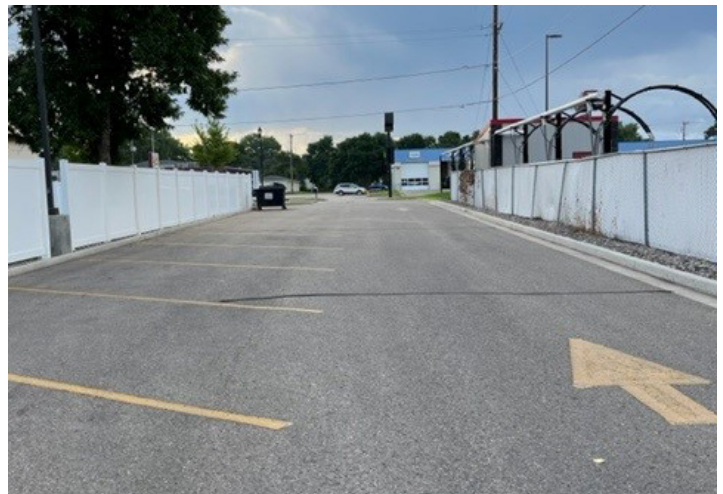
EXTRA EMPLOYEE PARKING