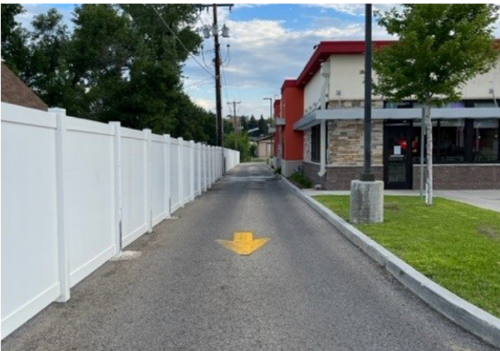
EASY DRIVE-THRU EXIT