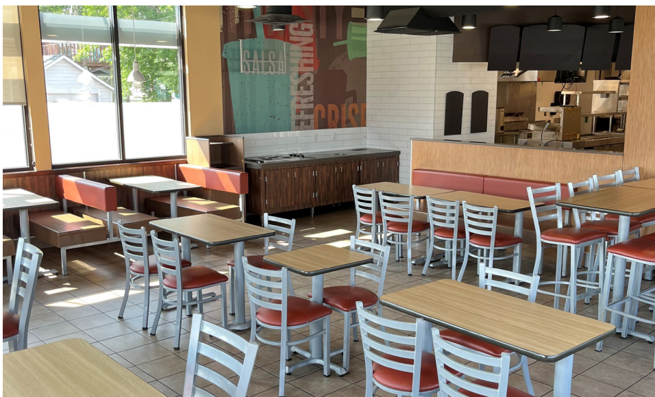
SUBSTANTIAL DINING ROOM W/ ABUNDANT DAYLIGHT