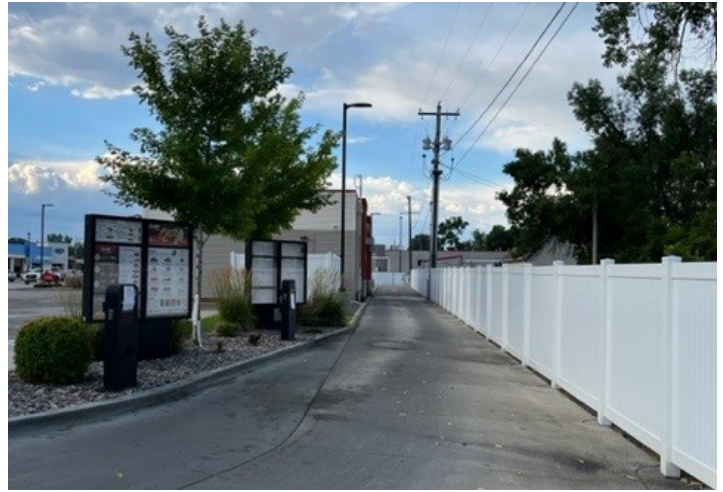
HIGH STACK DRIVE-THRU