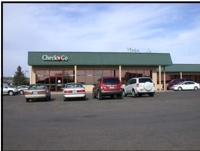
View from South Parking Lot