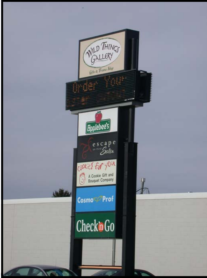
Pylon Sign on 3rd Street